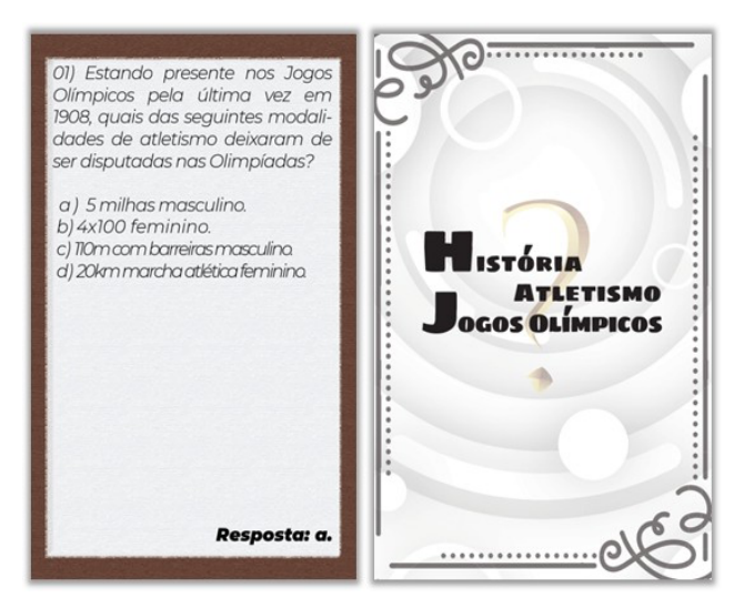
Figure 3: Image of question cards.

The development of the game takes place in the dynamics of answering the quiz correctly, so that all participants fix the content of the questions and are more interested in athletics and the Olympics. With the proposal of being a quick game, each game must have a maximum of 30 minutes, enough time for one of the players to reach the finish line with a good performance in the questions and in the throw of the dice. At the end of the game, it is intended that part of the questions have been addressed, and the rest can be discussed in a future game.