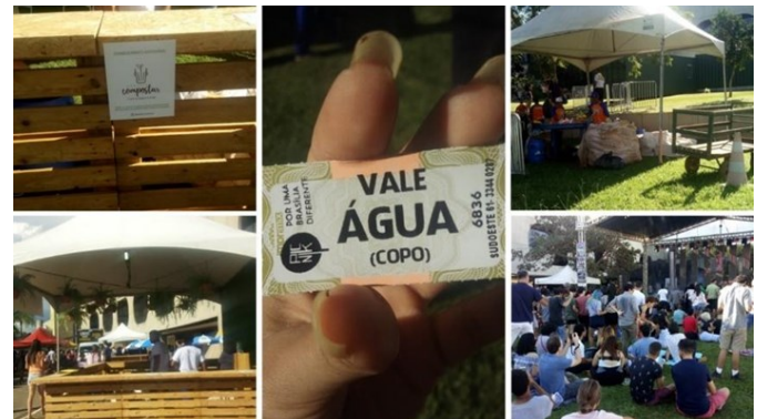
Figure 02 - Sustainable actions employed at Na Praia, edition 2018

On the other hand, saving the use of plastic is also a concern of the organizers, so the event adopts the use of manufactured packaging of corn starch that can be disposed of together with organic waste, they also encourage the use of an "eco cup", which is buying an eco-cup and after the event finishes, the participant has an option to return it and withdraw the money paid initially for the eco-cup.