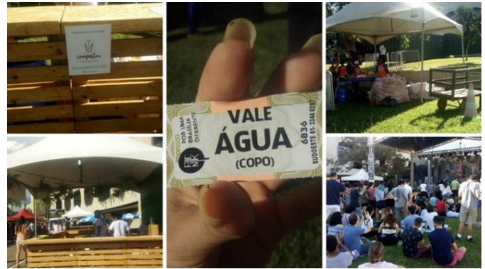
Figure 01 - Sustainable actions during Festival Picnik, edition 2019.

However, at Na Praia that works with several actions as it has been highlighted in the survey, with each edition producers are careful to recycle 95% of waste that is generated in the event, and so the next event has as its aim to exceed this percentage. Thus, the organization of Na Praia is an example of an incentive for other producers on the possibility of seeking sustainable alternatives without the event are still attractive.