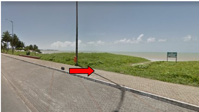
Figure 2: absence of tactile floor