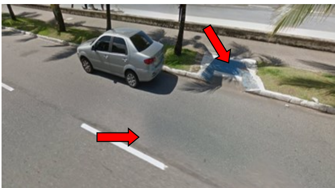
Figure 3: guide for wheelchair users without any crosswalk