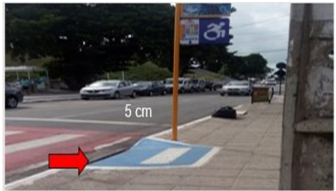
Figure 5: ramp for people with wheelchairs