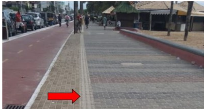
Figure 4: tactile paving