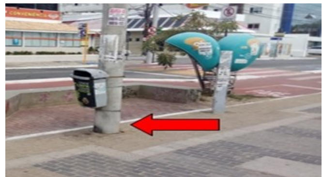
Figure 6: pole near the tactile paving