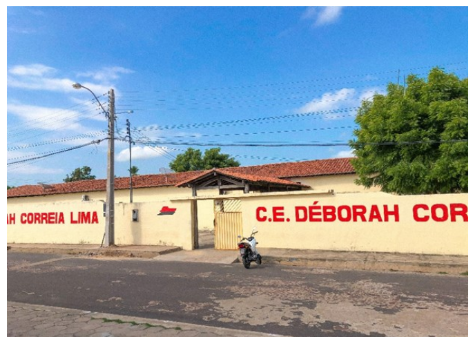
Figure 2 - Deborah Correia Lima Teaching Center

The location chosen for the development of the project was the Centro de Ensino Deborah Correia Lima (Figure 2), located at Travessa Alexandre Mendes, 03, Centro, São Bernardo, Maranhão. It is a state public school, approved on 12th March, 2009 and recognized by Resolution No. 253/2009 CEE/MA (State Education Council of Maranhão) and the MEC (Brazilian Ministry of Education).