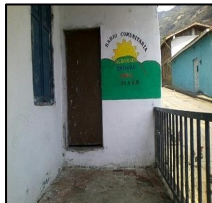
Figure 5 – Creation of community radio "A"; repair of access roads "B", deterioration of roads

The access roads to the village which were deteriorated by the weather and frequent rains, facing the complaints by visitors and residents, there was the direct intervention of the community council organizing and developing a project for its realization by approving the resources and workers for the arrangement of the worst edge failures and most deteriorated spaces of the road, the community collaborated by offering food and supervision, taking turns in the responsibility by family of the work, which began on 21/01/2018 and ended on 27/12/2018 satisfactorily, highlighting that for more than 20 years this type of improvement had not been done (Figure 5 B, C).