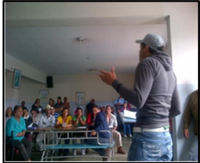
Figure 2 – Sensitization, stage with the community and educational institutions.

At this moment, Teppa (2006) suggests that the plan should be elaborated in an adaptable and permeable way, it is necessary to include its beneficiaries for the