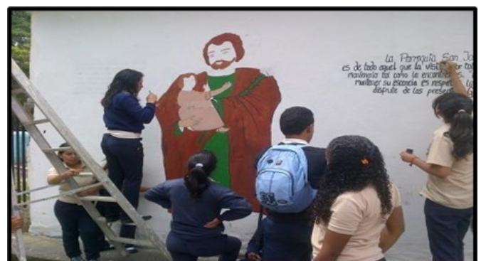
Figure 3 – Elaboration of religious murals with high school students, A; planting of ornamental plants by elementary school students, B;

plants and trees were planted, providing a better landscape change and content for visitors (Figure 3).