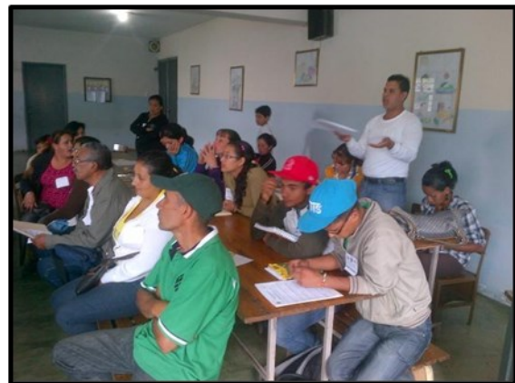
Figure 6 – Intellectual production process, reflection stage, collaborators and participants

The results of the reflective opinions served as the basis for the final report of the research, as well as the collective report of the community, which serves as a reference to continue with their process of change.